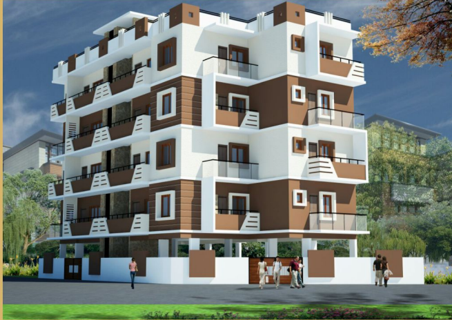
ASHIRWAD ELEGANCE SBM COLONY, GIRINAGAR