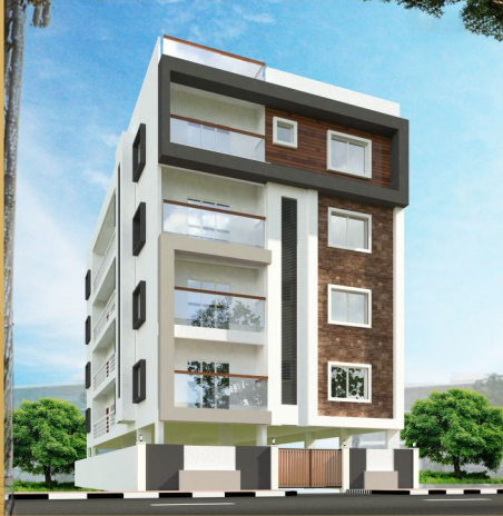
SWASTIK ELEGANCE MIDDLE SCHOOL ROAD, VV PURAM.