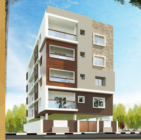
SHAMBHAVI ELEGANCE 8TH BLOCK, JAYANAGAR