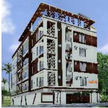
MARVELLA SUKRITI BASAVANAGUDI