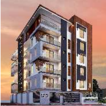
MARVELLA RAJKAMAL 9TH BLOCK, JAYANAGAR