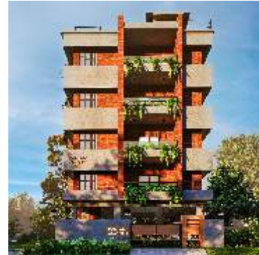
MARVELLA ANANDAM 2ND BLOCK JAYANAGARI