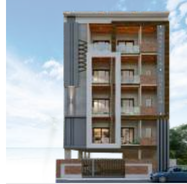
MARVELLA GOKULAM 7TH BLOCK, JAYANAGAR