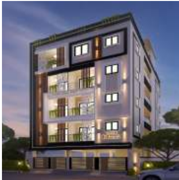
MARVELLA PRAPTI 5TH BLOCK JAYANAGARI